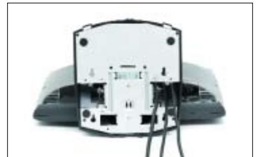
"Cable-Through-Bottom" routing option for seamless counter or wall installation